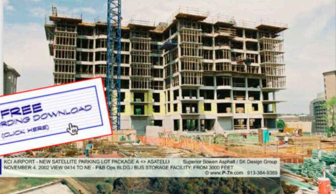
P-Tn KCI AIRPORT - NEW SATELLITE PARKING LOT PACKAGE A ↔ ASATELLI Superior Bowen Asphalt / SK Design Group NOVEMBER 4, 2002 VIEW 0414 TO NE - P&B Ops BLDG / BUS STORAGE FACILITY: FROM 3000 FEET