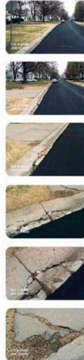
VideoRECORD stillframe series