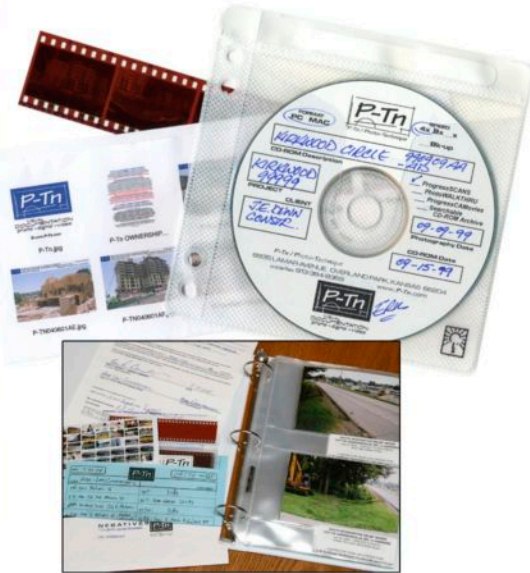
P-Tn KIRKWOOD CIRCLE: PHASE 1D - KANSAS CITY, MISSOURI MAY 4, 2004 - VIEW TO WNW - MID-RISE 040504AC.JPG [04091A-4] J.E. Dunn Construction KIRKWOOD ↔ www.P-Tn.com 913-384-9369